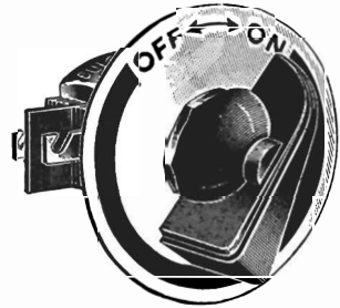
Switch with Part No: 8780 Dial and K.107/Knob added