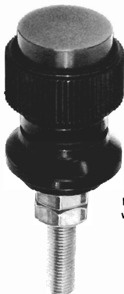
L1005/1 with H Fitting.