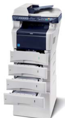
Product depicted includes optional extras.