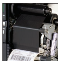
Accepts all ribbon types