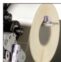
Increased label capacity