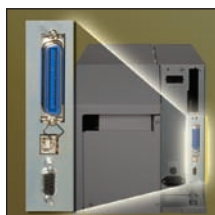
Easy Connectivity: three standard interfaces & optional network interface