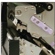
Easy change printhead