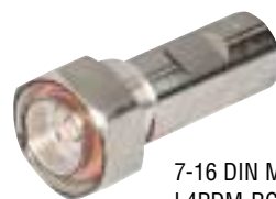
7-16 DIN Male L4PDM-RC