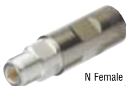
N Female L4PNF-RC