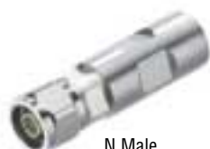
N Male L4PNM-RC