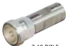
7-16 DIN Female L4PDF-RC