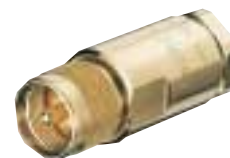
UHF Male L44P