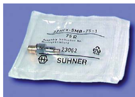
Single (sealed by welding)

Attributes: Electrostatically conductive, External resistance 10^8 \dots 10^{10} \Omega Air-tight Chemically resistant Chlorine-free Halogen-free