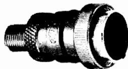
C-11-01F 3 Contact Cable Connector with coupling ring - Female.