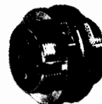
C-11-51M 4 Pin Panel Connector with Coupling Thread - Male.