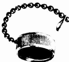
C-11-06C Dust Cap & Chain