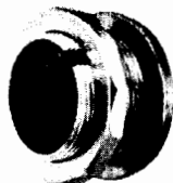
C-11-5F 4 Contact Panel Connector with Coupling Thread - Female.