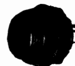
C-10-6F Panel Female with coupling thread