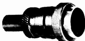
C-11-31F 4 Contact Cable Connector with Coupling Ring - Female.