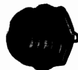
C-10-9F Panel Female with coupling thread