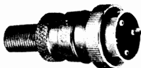
C-11-3M 4 Pin Cable Connector with Coupling Ring - Male