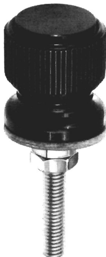
L309/1 with F Fitting.