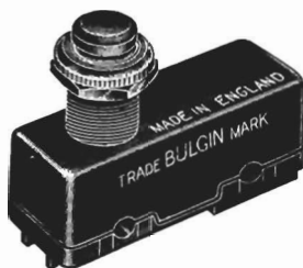
List No: S.720