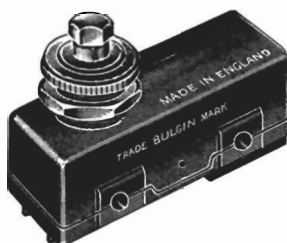
List Nos: S.610-612