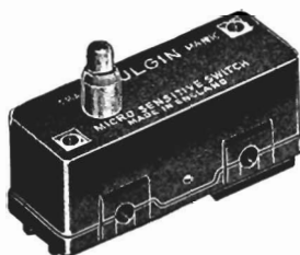
List No: S.778