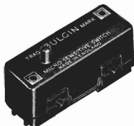
List No: S.725