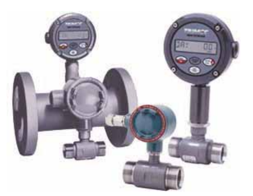
Shown with a RT100 Series Rate Totaliser fitted