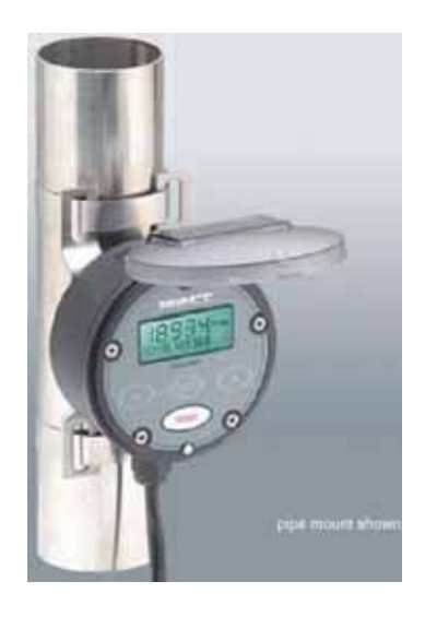
BT Series Battery Totaliser Display Screens: