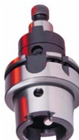
HSK A 50