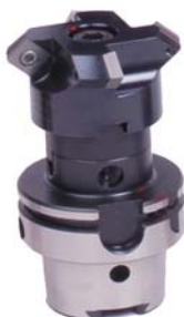
HSK A 100