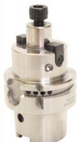
HSK A 40