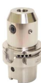
HSK A 32