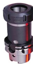
HSK A 63