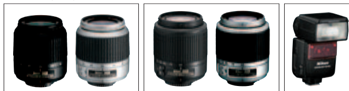
New AF-S DX Zoom-Nikkor 18-55mm f/3.5-5.6G ED

Support for Nikon's Total Imaging System includes compatibility with a wide variety of high-quality Nikkor lenses and the Speedlights SB-800 or SB-600 of Nikon's Creative Lighting System.