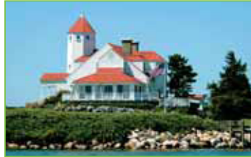
3.5x Optical Zoom-Nikkor lens plus 4x digital zoom equals 14x zoom range

The 3.5x Zoom-Nikkor Glass Lens gives you the power of a 36-126mm (35mm equiv.) lens, while Macro capability lets you get as close as 1.6 in. This combination is supported by Nikon's world-renowned optical technology, delivering crisp, clear images. All of which helps realize the full potential of our high resolution 5.1 and 8.0 megapixel CCD's. The COOLPIX P1/P2's exclusive image processing technology takes true-to-life images a step closer to reality. A 256-segment Matrix Metering system enables optimal exposures in even the most challenging lighting situations.