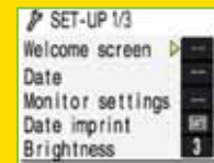
View as a list