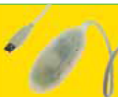
Wireless Printer Adapter (PD-10)