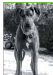
Black and White