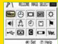
Or as Icons. If you have any questions hit the help button .

With the new oversized 2.5" LCD screen you won't miss much but Nikon did not stop there when designing these cameras. A new interface has been designed that can be viewed as icons or as a list. If you get confused just hit the Help Button . It will explain the function in the main menu.