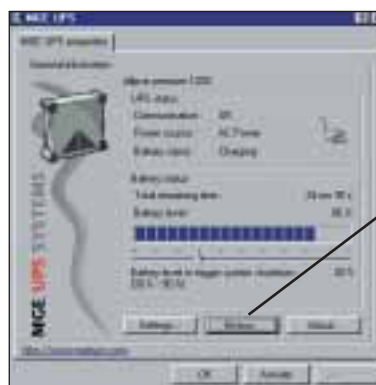
UPS status at a glance

The different screens indicate the status of the UPS in a very simple manner.