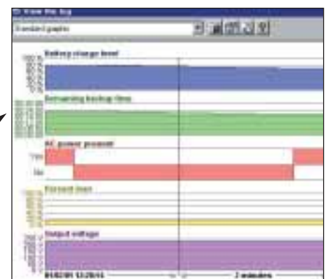
Graphic display of log