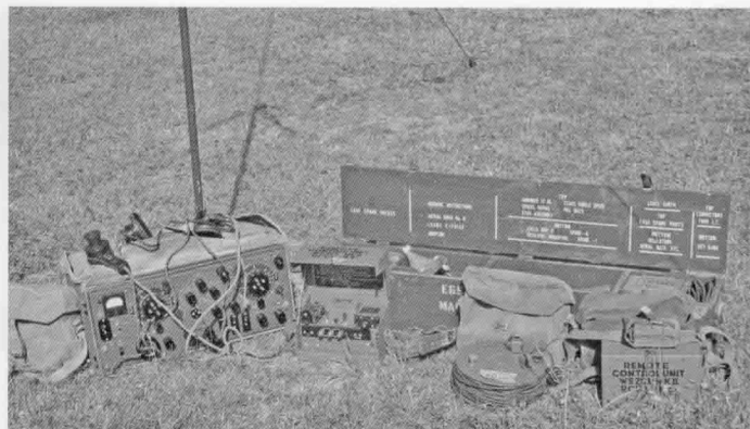
Moonlight with antenna.