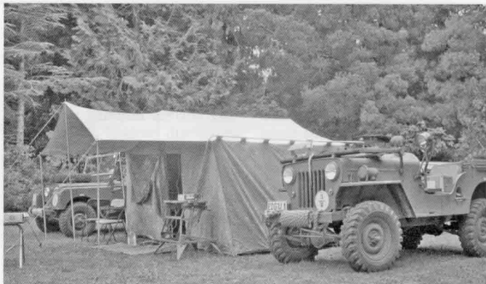
Revvng up the radios, showing the jeeps.

Well, Brent may have been a bit disappointed that the gear didn't work as well as when it was built over 60 years ago; but I was delighted with the marvellous photos he sent me. Some of them are reproduced here. The