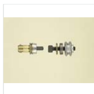
Conversion Kit For Installation Tool #84220, 5/16-18 (Pack of 1)