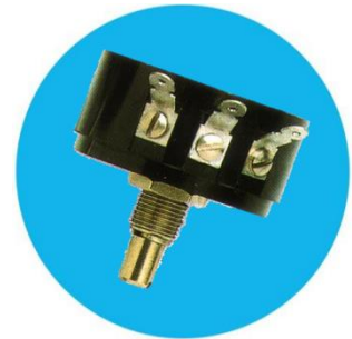
Standard Resistance Laws