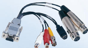
Breakout Cable (included)