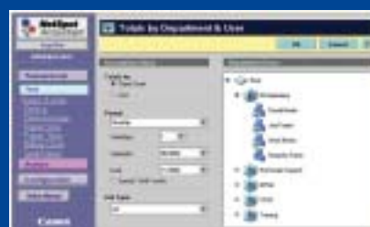
Device & user totals menu