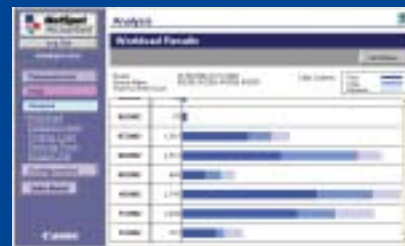
Device workload results report

With NetSpot Accountant, administrators can customise their view of the network to suit the way they want to work. By offering a choice of view by protocol type, device type, name, or location, NetSpot Accountant makes it possible for administrators to segment their devices into logical groups so they can manage them more effectively.