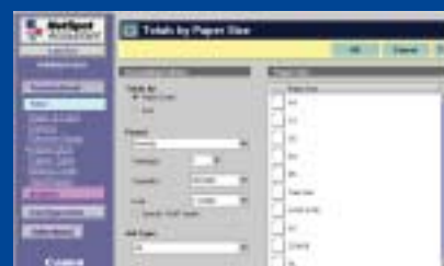
Paper size usage totals report