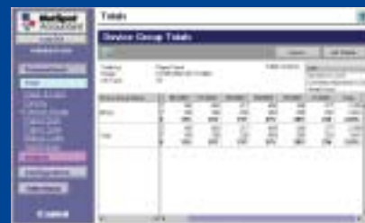
Device group totals report