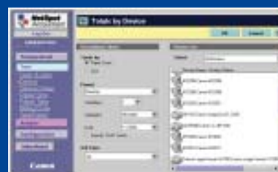
Device group totals by report