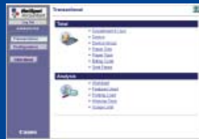
Transactional reports menu

If you work in any business that passes its printing and copying costs directly to its customers, such as a law firm, this feature will simplify your whole billing process and ensure that all your costs are recorded accurately.