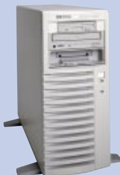
Integrated HP SureStore T20Xi tape backup solution

From the exceptionally cost-effective HP SureStore T20Xi bundle to the high-performance HP SureStore Digital Audio Tape (DAT) accessory, there's a solution for you.