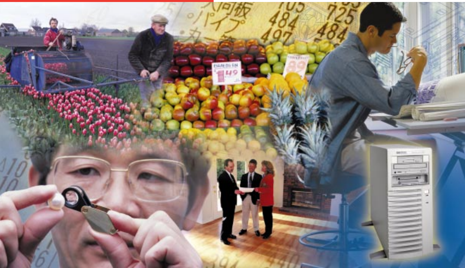
HP NetServer E 60 Product brochure