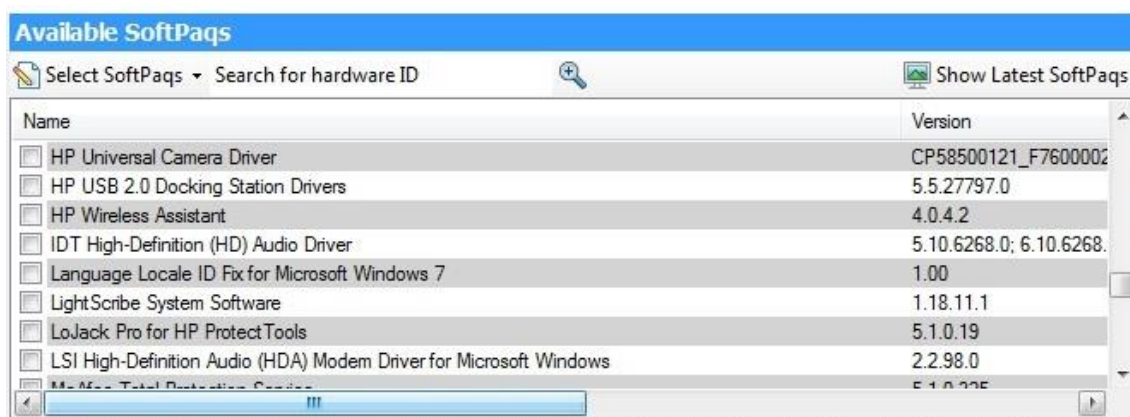
Figure A-2. Available SoftPaqs list