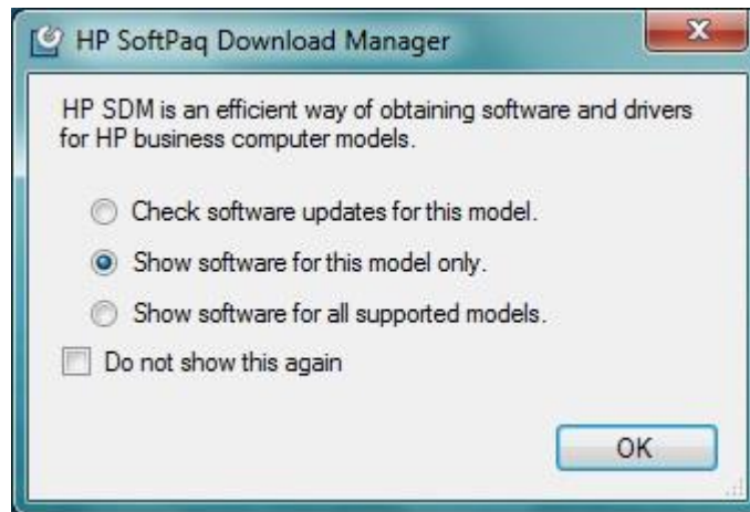
Figure A-1. SoftPaq Download Manager menu

The current platform is automatically displayed and selected in the Product Catalog window.