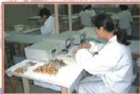
Electric characteristic test