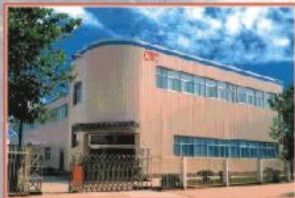
Machining branch factory