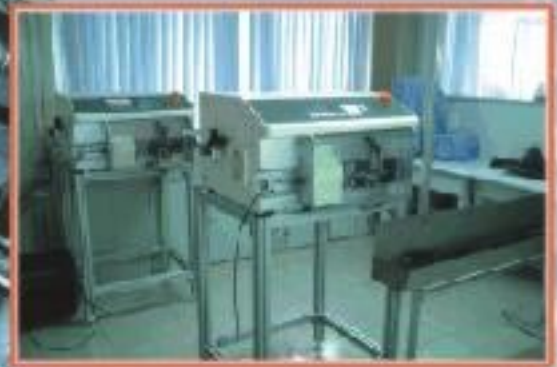
Imported cable processing machine