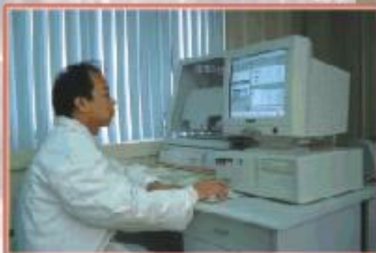
Raw material/coating analysis