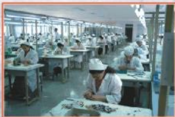
A view of assembly line