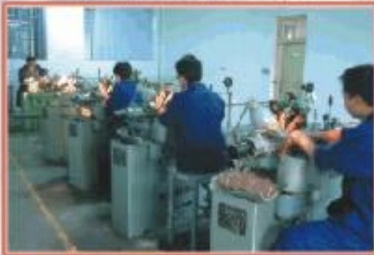
Processing machine for center conductor