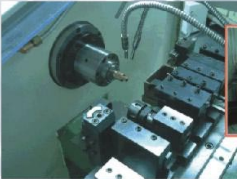
A view of imported machine for housing machining