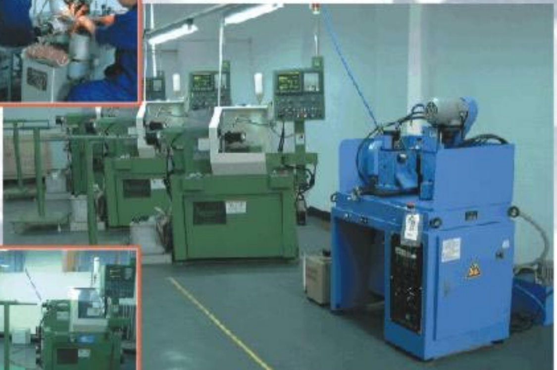
Imported CNC lathes