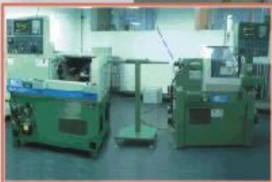
Imported machine for housing processing