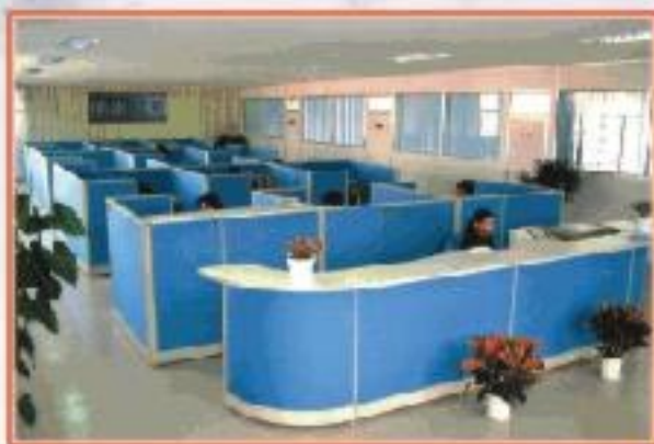
A view of office area