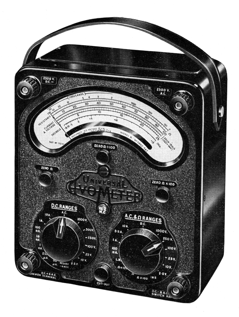
THE MODEL 8 AVOMETER MK. II