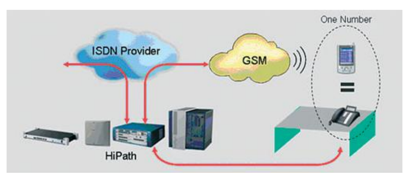
HiPath 3000 offers an integrated mobility solution (Mobility Entry) and a mobility solution based on Xpressions Compact (HiPath Xpressions Compact Mobility).

Calls must be forwarded to different standins depending on the situation. These destinations are easy to change and redirect while on the move. This ensures that callers are always connected to the right phone of the most suitable contact.