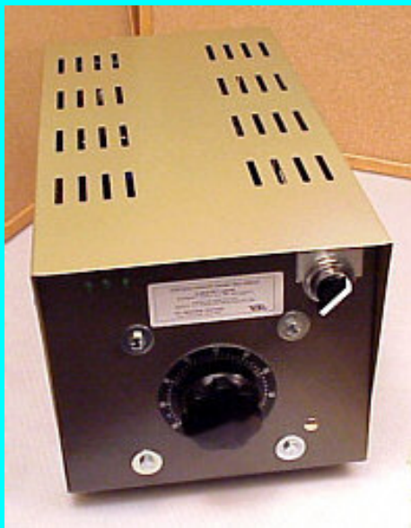
Typical Bench Top 3-Phase Model